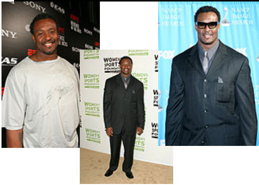
Willie McGinest can often be seen lighting up the red carpet for a variety of events in his native Southern California, including the NAACP Image Awards, ESPY Awards and the BET Awards.