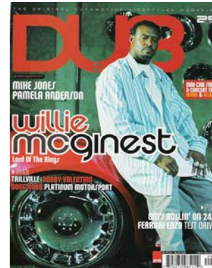
Willie McGinest graces the cover of DUB magazine, the premier publication for the urban automotive scene.