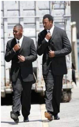
Willie McGinest and Derrick Brooks strut their stuff on the set for the NFL's "Road to Forty" ad campaign for the Super Bowl XL.