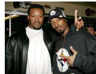
Willie grew up in Long Beach with famed rapper Snoop Dogg and helps to support kids playing in the Snoop Youth Football League.