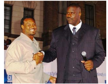
Willie McGinest joins Shaquille O'Neal for the "Rollin' 24 Deep: GM All-Car Showdown."